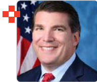
Jay Obernolte Vice Chair of the Congressional Artificial Intelligence Caucus US House of Representatives