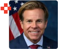
Mike Haridopolos Chair of the Congressional Subcommittee on Space and Aeronautics US House of Representatives