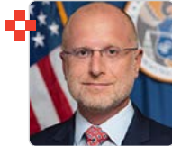
Brendan Carr Commissioner FCC