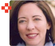
Senator, Maria Cantwell Chair of the Committee on Commerce, Science and Transportation US Senate